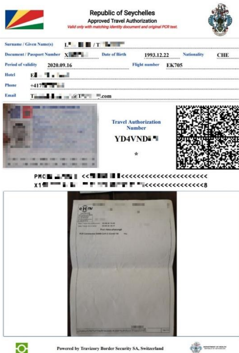
Paper / PDF version: